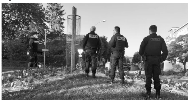
Charleville-Mézières, May 31st, 2021

During the weekend, in the Manchester and Ronde Couture neighbourhoods, rubbish containers and vehicles were set on fire. Four of the seven cameras in the Manchester neighbourhood were destroyed. In La Ronde Couture, the score was two out of nine. For these six destroyed cameras, the financial damage for the municipality would amount to nearly 150,000 euros. The LR mayor of Charleville-Mézières, Boris Ravignon, told France 3: «There is nothing classic about this, it is a scandal. Hooded teams cut out four devices in broad daylight with grinders, successively, from the main cameras in the area. This is a challenge to republican law. The message is: we don't want you to know what's going on any more.»