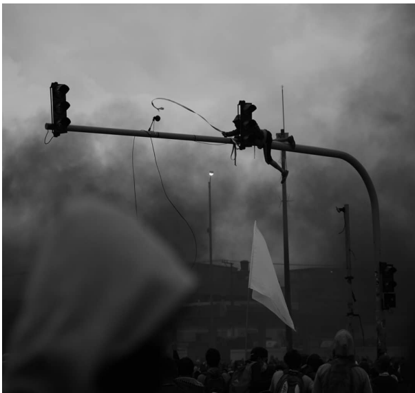
Bogotá, May 5th, 2021

Translated from French by an anarchist comrade for Act For Freedom Now!