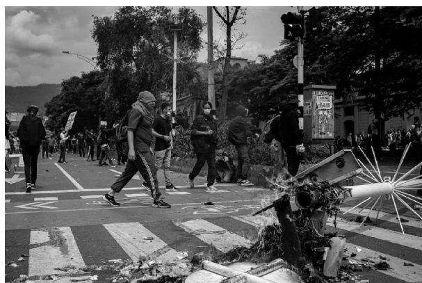
Medellín, April 28th, 2021