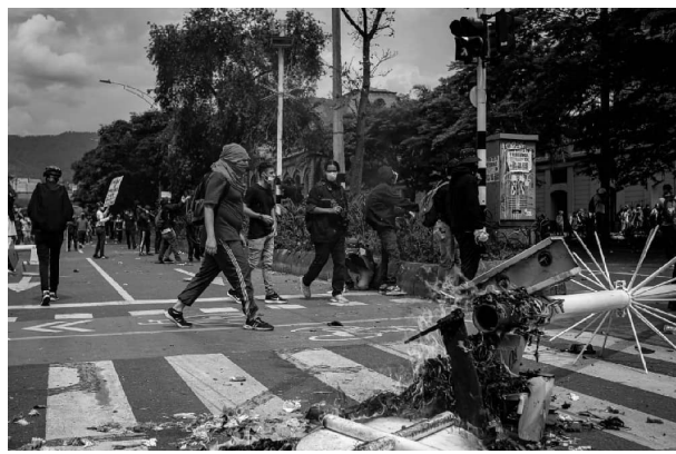
Medellín, April 28th, 2021