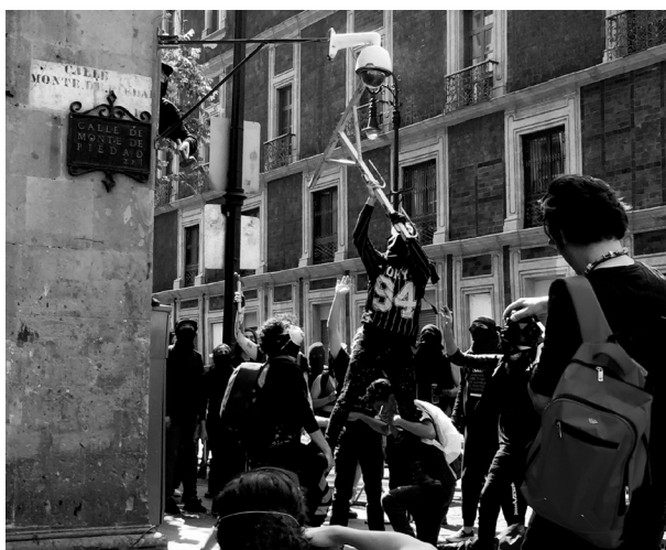
Mexico DF, June 8th, 2020