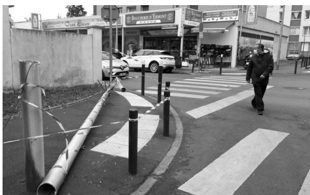
Ermont, May 11th, 2020

During the main May Day demonstration (inter-union etc.), several CCTV cameras were sabotaged with paint from the “cortège de tête” (combative front of the demonstration).