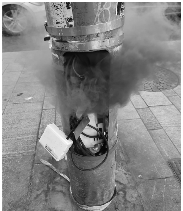
Marseille, March 21st, 2021

During the carnival, the internal connections of at least one CCTV mast were set on fire, putting the cameras attached to it out of action.