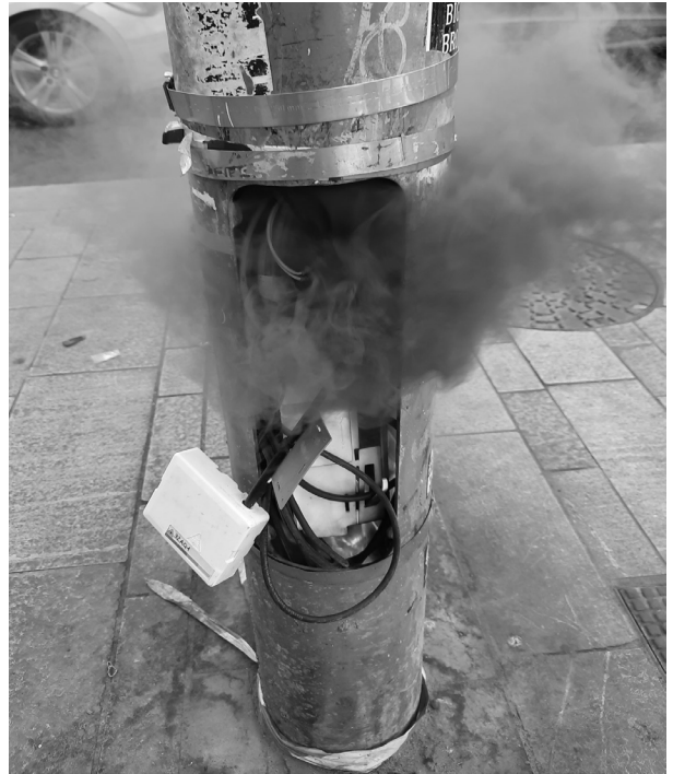
Marseille, March 21st, 2021

During the night, in the Petite Hollande district, individuals dressed in black and wearing balaclavas managed to climb poles and rip off the globes of the surveillance cameras, which were well protected.