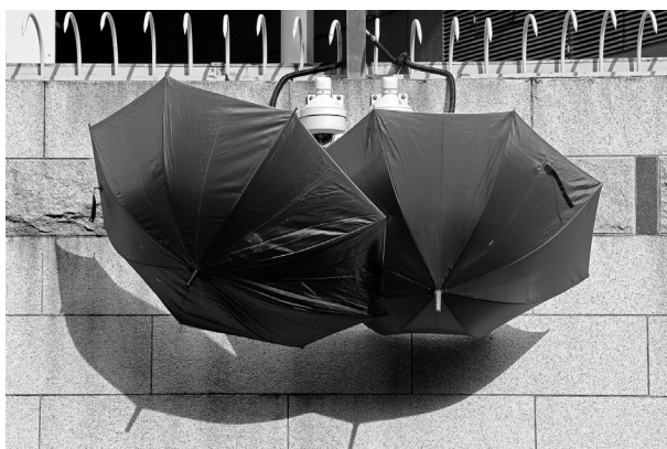
Hong Kong, June 2019