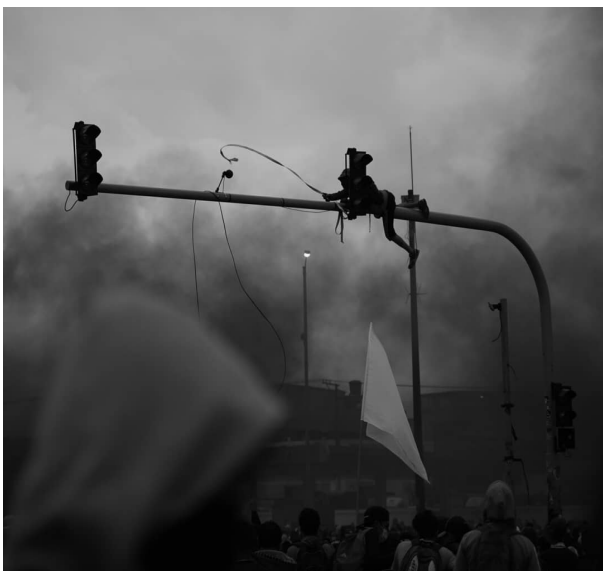
Bogotá, May 5th, 2021

Translated from French by an anarchist comrade for Act For Freedom Now!