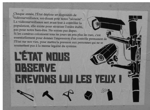
Bagnolet, March 16th, 2021

As riots broke out in the city in the early evening, at around 9:50pm individuals attacked a pole on which a surveillance camera was fixed. According