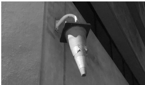
Portland, August 20th, 2020

In the Jean-Monnet car park, avenue de l'Europe, a car is set on fire at the foot of a mast overhung by a video surveillance camera, to put it out of action. When the police arrived on the scene,