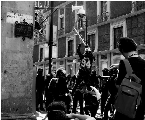
Mexico DF, June 8th, 2020